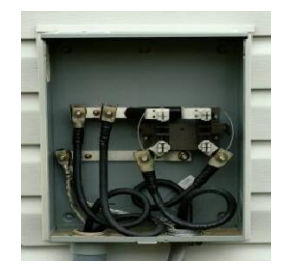
Step 2a Hi-Lug Ground Installation

Install the Neutral/Ground lead connection from GenerLink<sup>TM</sup>. Depending on the type of meter can, either a #6/#8 Hi-lug or a split-nut ground connection should be used. The grounding method selected should be consistent with local codes and standards for your area.