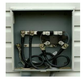
Step 2a Hi-Lug Ground Installation

Install the Neutral/Ground lead connection from GenerLink<sup>TM</sup>. Depending on the type of meter can, either a #6/#8 Hi-lug or a split-nut ground connection should be used. The grounding method selected should be consistent with local codes and standards for your area.