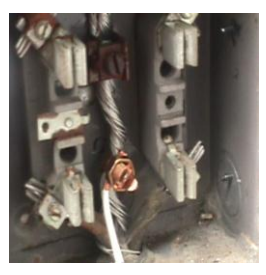
Step 2b Split-nut Ground Installation