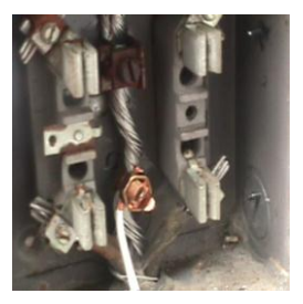
Step 2b Split-nut Ground Installation